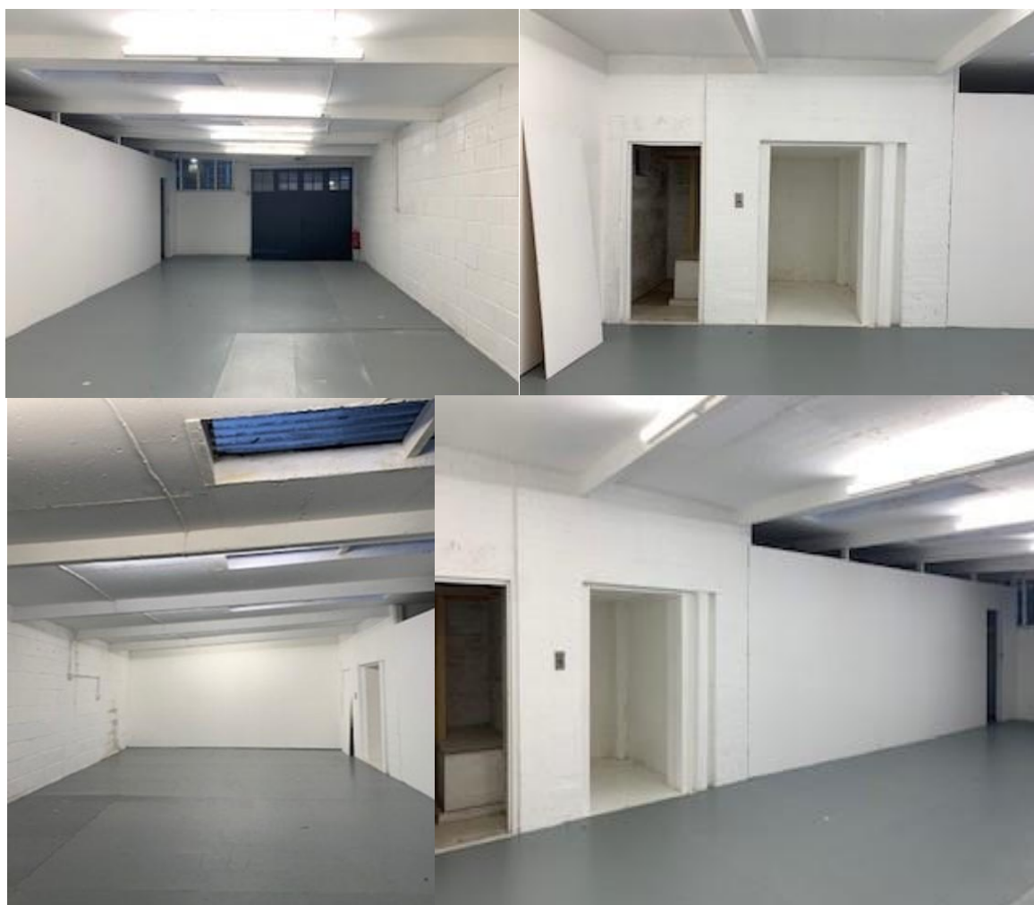
A Ground floor unit with west facing windows and roof lights.